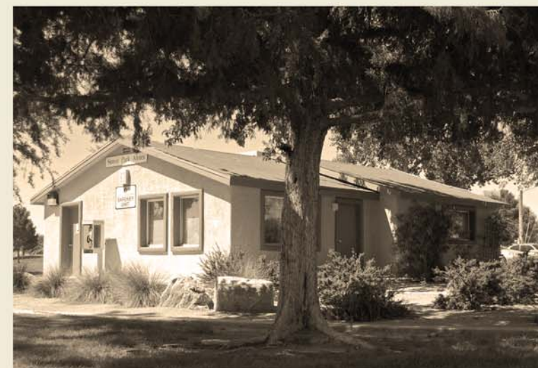
This is the only remaining ranch building on site.